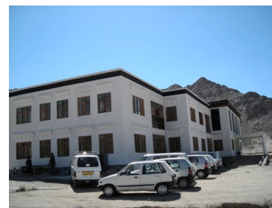
Patient visit for medical check up