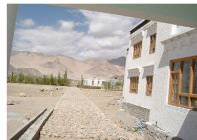
Government making link road connection to LHF

We are also thankful to the head of the Singaporean Chen Xian temple who are sponsoring the salary of our lady doctor.