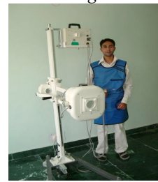
Fayaz X-ray Tech.