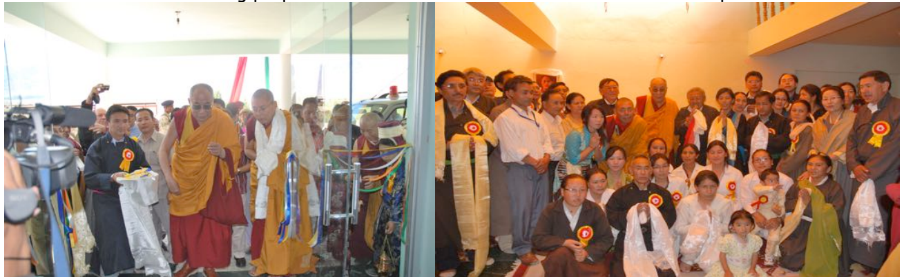
Children welcome to His Holiness The Dalai Lama to LHF hospital

On 14 th August 2009, H. H. The Dalai Lama was requested to visit our hospital for the inauguration of our hospital. A detailed report of activities and expenditures was presented by the President of LHF. His Holiness appreciated our activities and advised us to keep up the tempo to render compassionate services to our patients. We the members of LHF and many other experienced doctors from the Government Hospital gathered to receive the blessing and sermon of His Holiness. His Holiness especially discussed diseases related to high altitude as well as rheumatic heart diseases with senior doctors. His Holiness was informed by the physician specialist that rheumatic heart disease has almost been eradicated due to timely prophylactic measures. A society of sixteen friends and women's group of Spituk village put in great effort while making preparations for HH The Dalai Lama's visit to this Hospital.