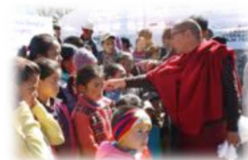
President of LHF interacting with the students